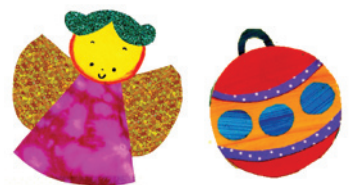
Illustration copyright © 2009 by Karen Katz