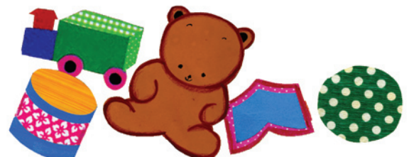
Illustration copyright © 2009 by Karen Katz